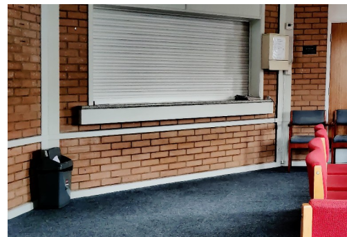
New electric shutter to kitchen